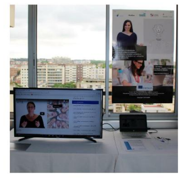
5 topics crucial for teachers and trainers